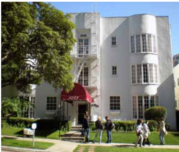
Claremont Hotel residence

The Claremont Hotel offers single rooms each with private bathroom facilities. Additional amenities include a common lobby/TV room, as well as a coffee room where students can enjoy complimentary tea or fresh coffee. From the property, students can easily walk to the UCLA campus. Nearby public transit provides students with access to Santa Monica, Beverly Hills, Hollywood and Universal Studios.