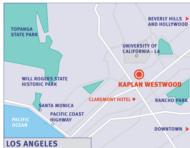
Location of Kaplan's Westwood Center and the Claremont Hotel

Claremont Hotel 1044 Tiverton Avenue Los Angeles CA 90024 USA